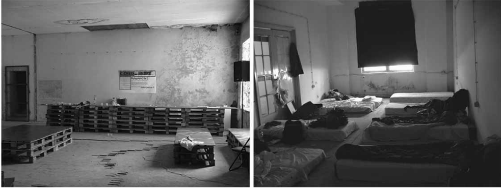
Fig. 1. C.CRED/Collective CREative Dissent, C.CRED Bar and Bedroom, at Urban Festival , Zagreb, 2005.