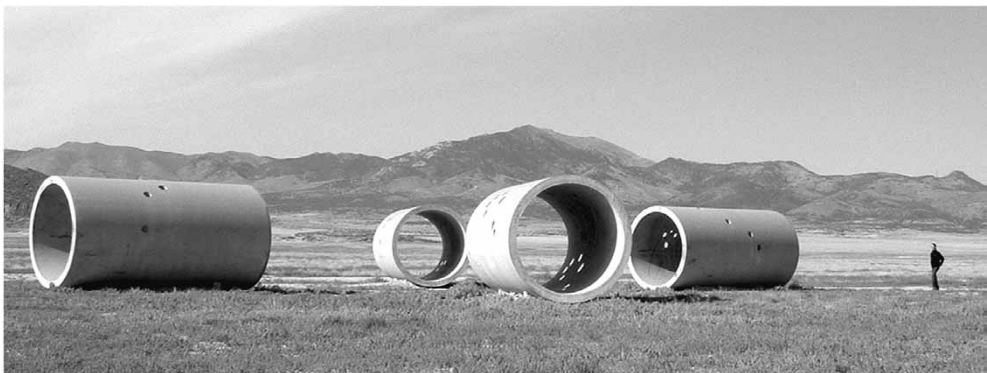
Fig. 2. Nancy Holt, Sun Tunnels , Utah.

2b London, November 2005. An experiment in irregularity and numeric walking. I take a walk. Every four hundred and forty-fourth step I stop and take a four second sound recording. The plan is to play the sound-recordings in different keys and substitutions of fourths, in a free improvisation of four hundred and forty-four seconds. (1) November 22, 1.40 p.m. Whitechapel Road – Brick Lane – Bethnal Green Road. What is generated in the cityscape through the irregularity of my walking by numbers? A non-normative cityscape? The white noise of the city foregrounded and amplified, stuttered walking, fragments of conversation. Is this a kind of futurity, a future subterranean city, with no direction home, with no home? (2) November 22, 3.50 p.m. Old Ford Road – Victoria Park – Clapton Park – Lea Valley. Are we dealing in documentary terrains, or in a becoming black market economy of irregularities – of future regularities, 444, 666 – exchanged amongst a future community of walkers? The only way we